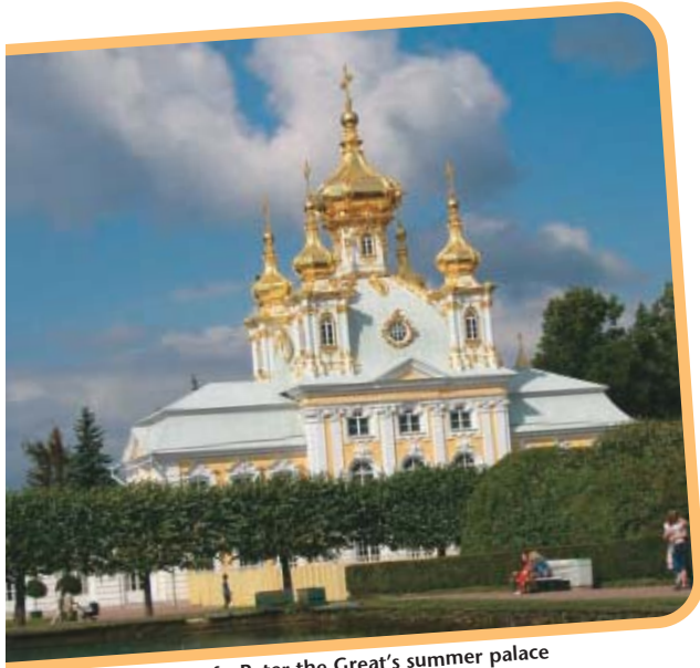
Peterhof—Peter the Great's summer palace

I hope many of you will get a chance to visit this special part of the world someday! 🌸