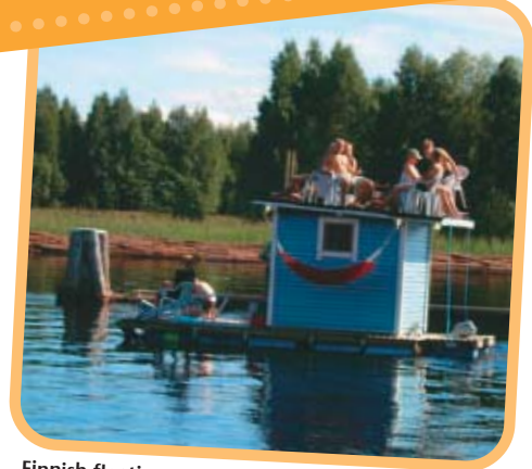
Finnish floating sauna

I had never been to Finland in the height of summer and the long artical days and very short nights energize you into wanting to do more than you would ever attempt to do in twenty-four hours at home. We crammed a lot into seven days. Aside from a few business meetings